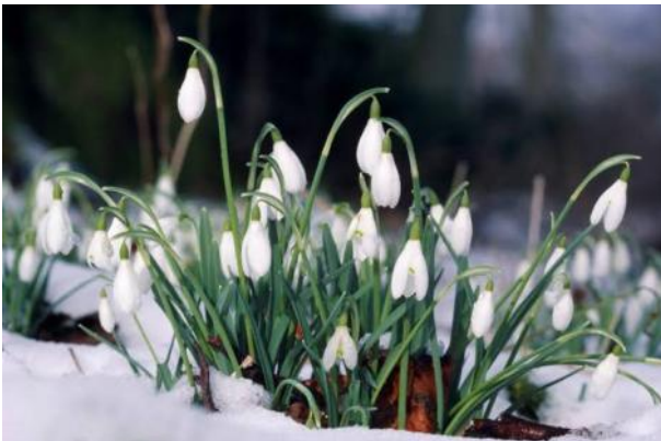
No fear of a blanket of snow

Snowdrops ( Galanthus , if you want to sound impressive at a garden centre) are among the earliest flowers to bloom here in Britain. We have some peeping out from their green spears on the 1st January. Luckily, despite their delicate apparel, snowdrops are surprisingly tough. They can push through the frozen soil, survive frost and layers of snow (not that we ever get that any more!) When their glorious shoots emerge, you know you've survived the darkest ten weeks, and the days will only lengthen.