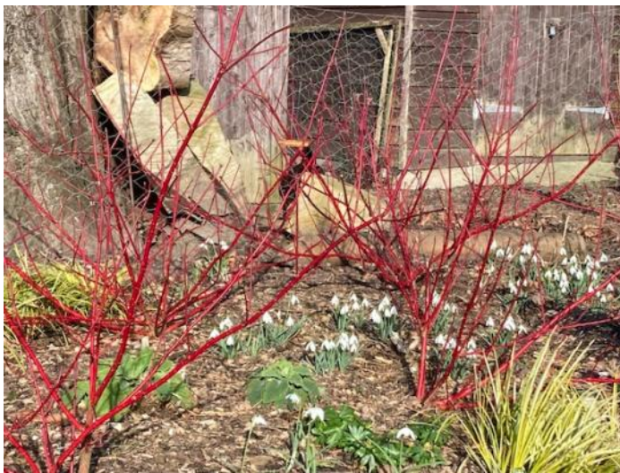
Left: Snowdrops (Galanthus Nivalis) growing beneath the red stems of Cornus alba Sibirica

You can plant snowdrops in the autumn using bulbs but by far the most successful way that I have tried is to split existing clumps and plant the snowdrops after flowering 'in-the-green'. In 2023 I found a company which would send clumps of snowdrops in this state. It was relatively inexpensive (phew!) and I planted the 200 'in-the-green' plants in a group beneath some red-barked Cornus. By 2024 I had a modest display in February but last year I had twice as many. And I have great hopes for 2026.