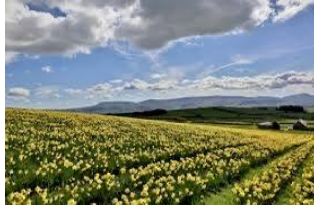
Right: Daffodils in The Black Mountains

Nowadays galantamine is harvested from daffodils (snowdrops not being cost-effective) and these produce the most effective galantamine if they are grown in challenging upland areas such as the Black Mountains in Wales. Chemical synthesis of this drug is possible but it is difficult and expensive so the natural world wins out!